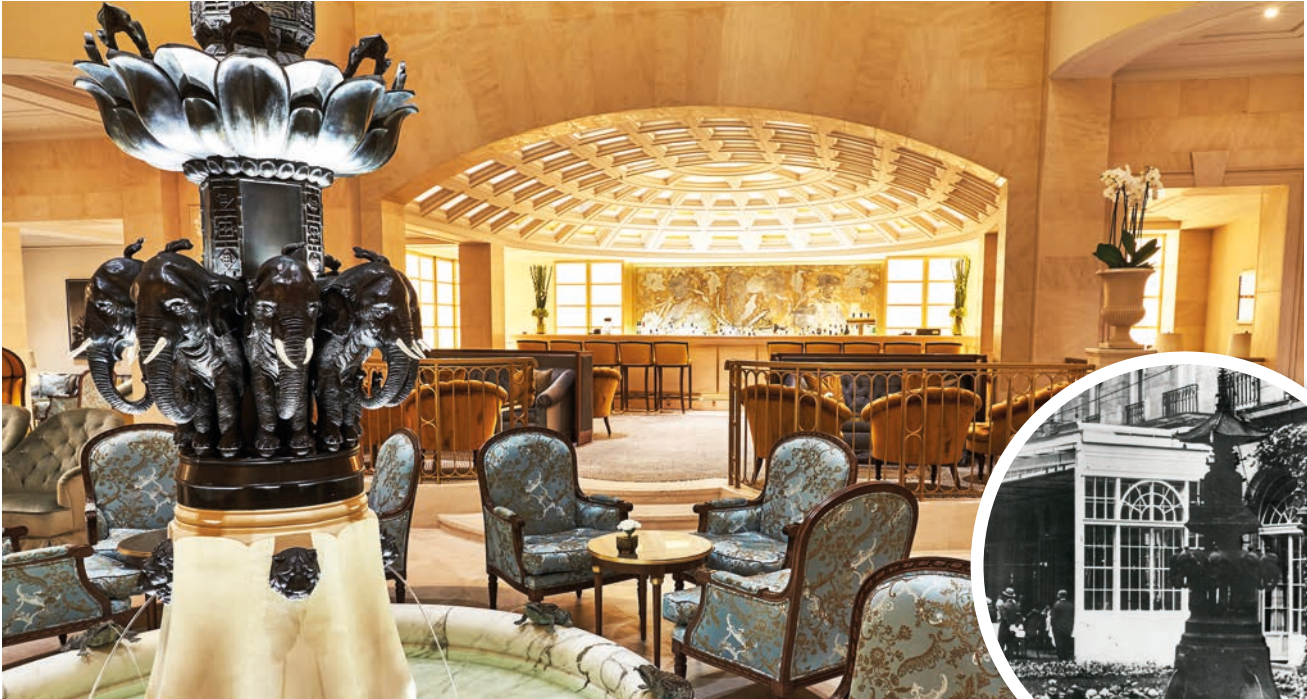
Elephant fountain at Goethegarten, 1930