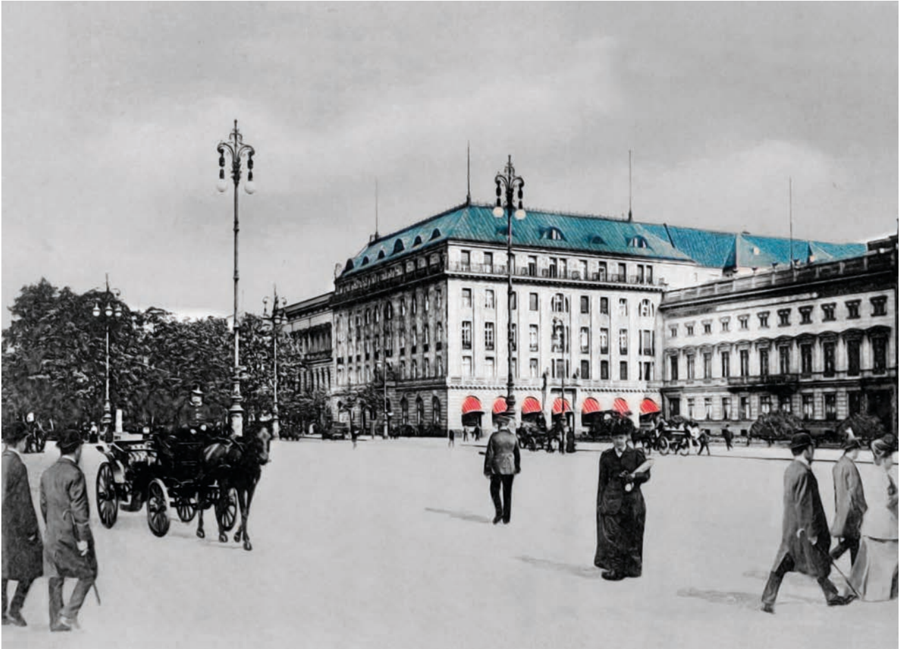
Hotel Adlon, 1926