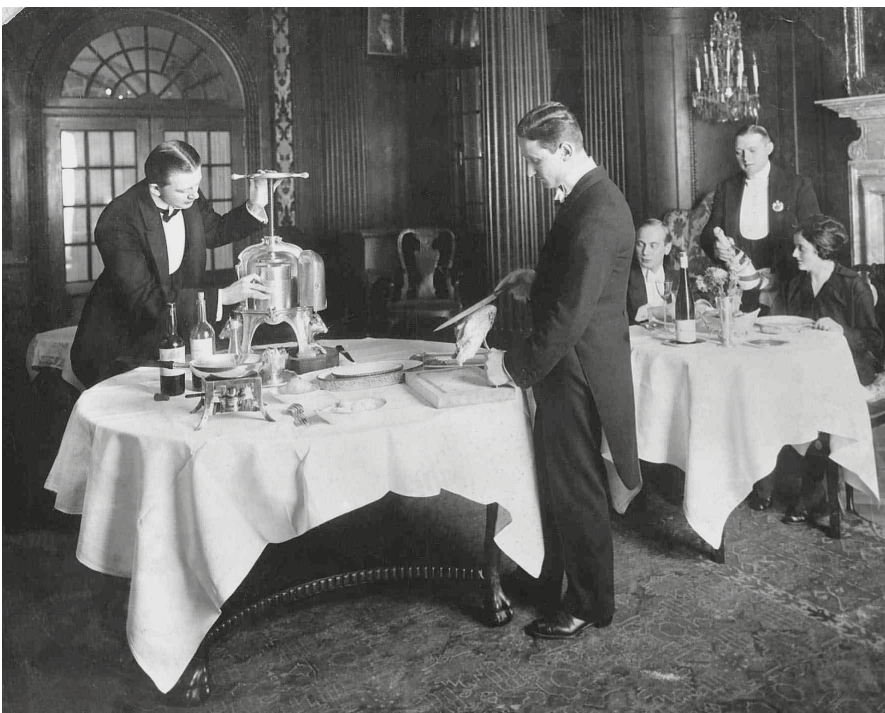
Service when preparing the sauce for the famous “Canard à la presse”

1964 – Side wing renovated and serves as a hotel in East Germany until 1970 1984 – East German Politburo orders complete demolition of the side wing 23 August, 1997 – Hotel reopens under Kempinski Today, Hotel Adlon reflects the classic style of its historic predecessor