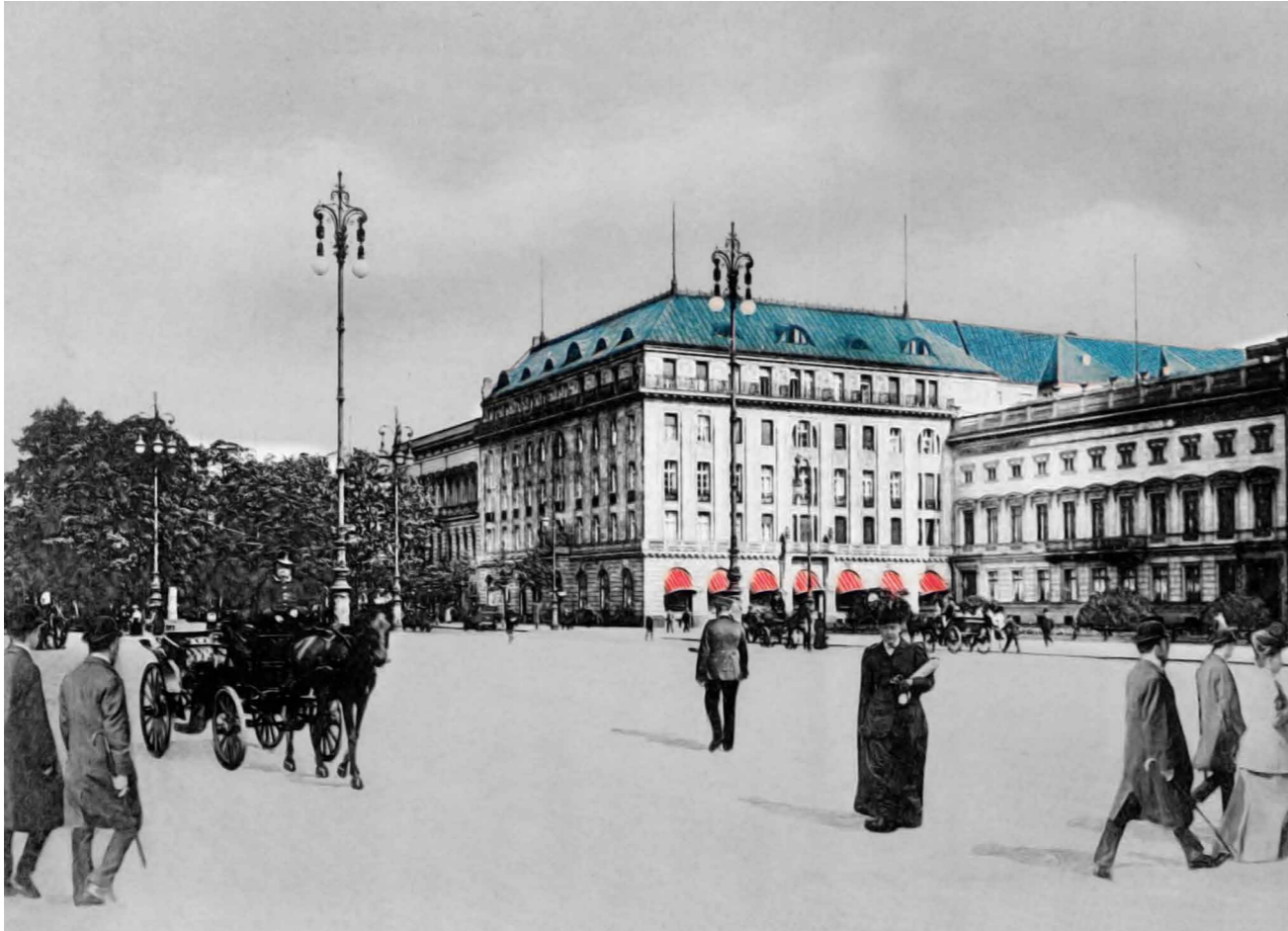
Hotel Adlon, 1926