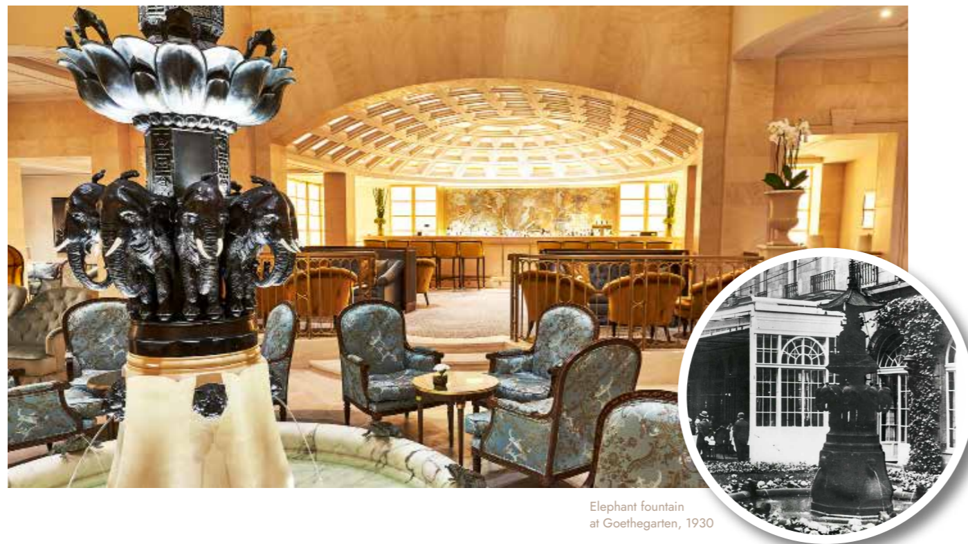
Elephant fountain at Goethegarten, 1930