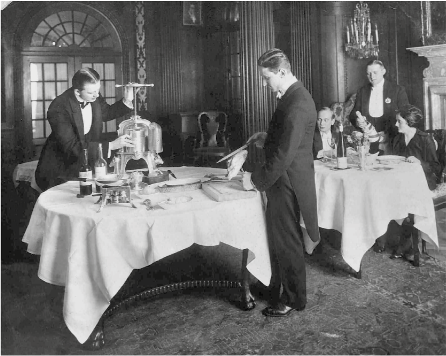
Service when preparing the sauce for the famous "Canard à la presse"