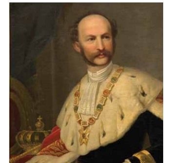
King Maximilian II. of Bavaria