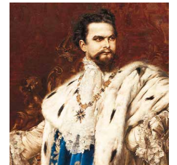
King Ludwig II. of Bavaria, son of King Maximilian II. of Bavaria