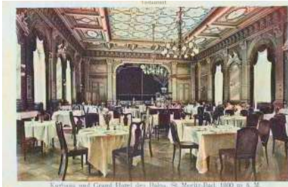
Kurfürst und Grand Hotel des Bains, St. Moritz-Bad, 1900 in 8. M.

A hotel with a rich history and a story that is still in the making.